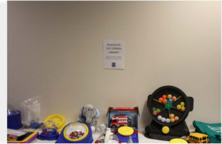
DeafBlind Toy Lending Library